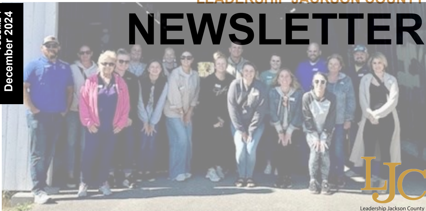
Leadership Jackson County